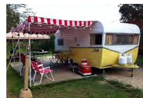
Vintage Shasta Trailer, (6)

Description: This area has the potential to be a catalyst site for redevelopment and reinvestment in surrounding properties within and near this node. Depending on ownership of the site, the highest and best use(s) for the site may go beyond restoration of the site as a destination campground. Potential uses include office, retail, higher-density residential, destination campground and event facility. Any redevelopment of the site may be enhanced by the preservation of design elements and/or actual structures that reflect the historic campground use, including signage, landscape walls, lighting, and pedestrian amenities.