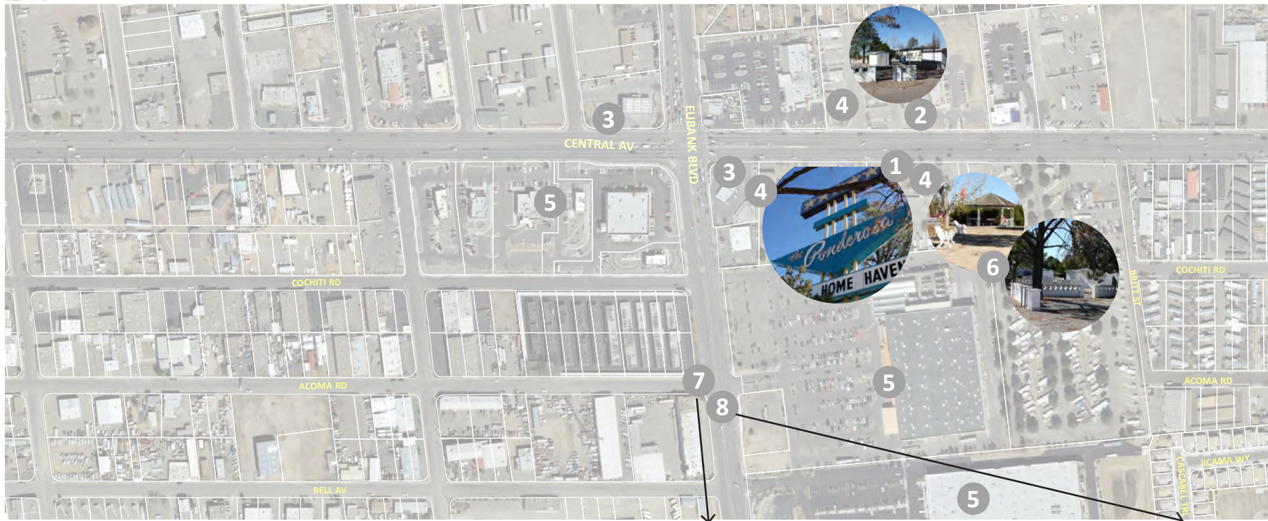
Existing assets and places of interest for the Ponderosa Park node.