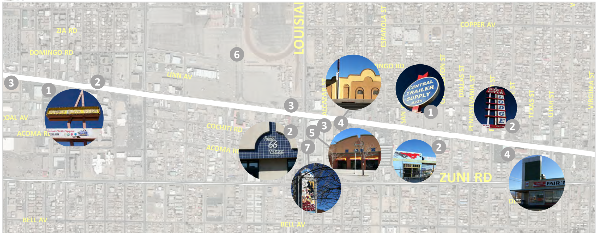
Existing assets and places of interest for the International District node.