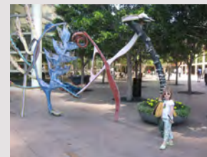
Public Art (6)