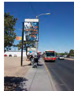
Orphan sign project near San Mateo, (5)