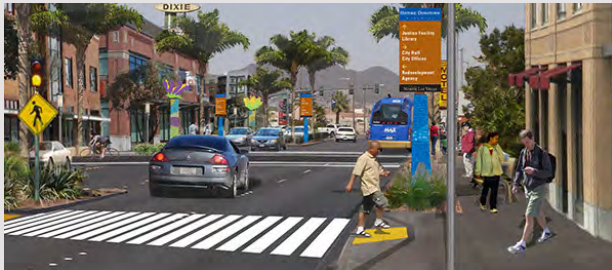
Enhanced pedestrian crossing and streetscape, (6)