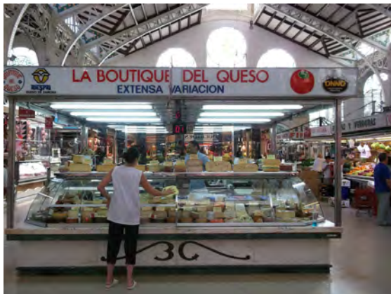
Public market, (6)