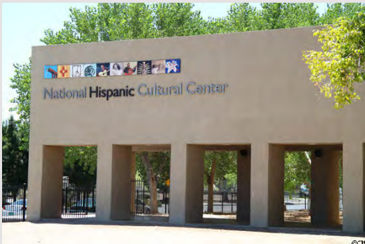
National Hispanic Cultural Center, (3)