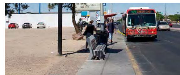
Rapid Ride stop near San Mateo, (5)