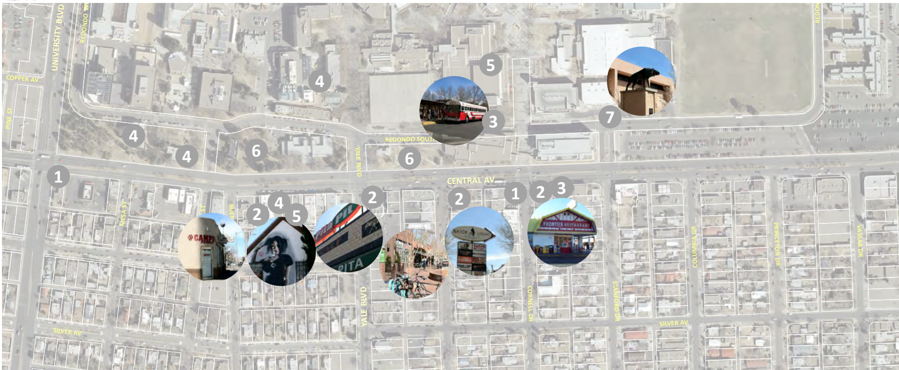
Existing assets and places of interest for the University District node.