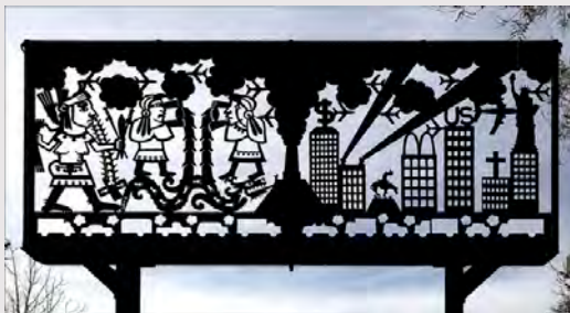
Yale Park, public art, (6)