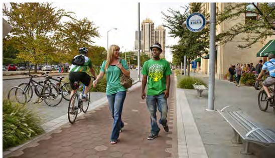
Urban Trail, (6)