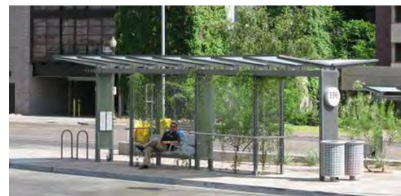
Street trees, (5)