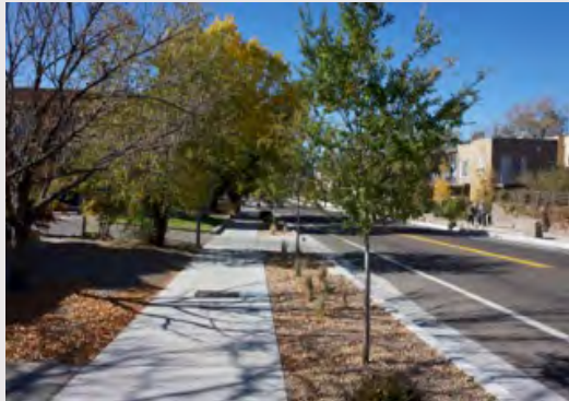
Street trees (5)