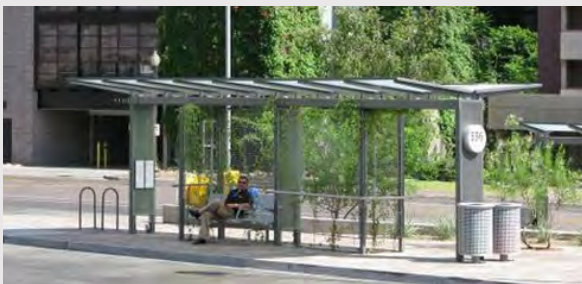
Tempe Transit, (6)