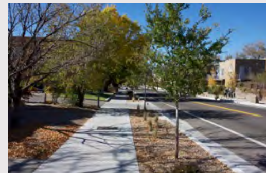
Street trees, (5)