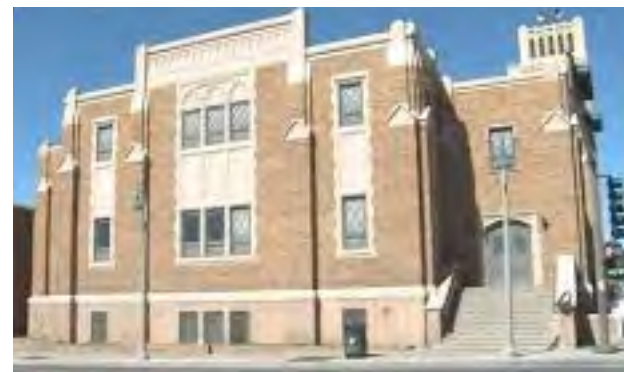
Innovate ABQ site, (5)