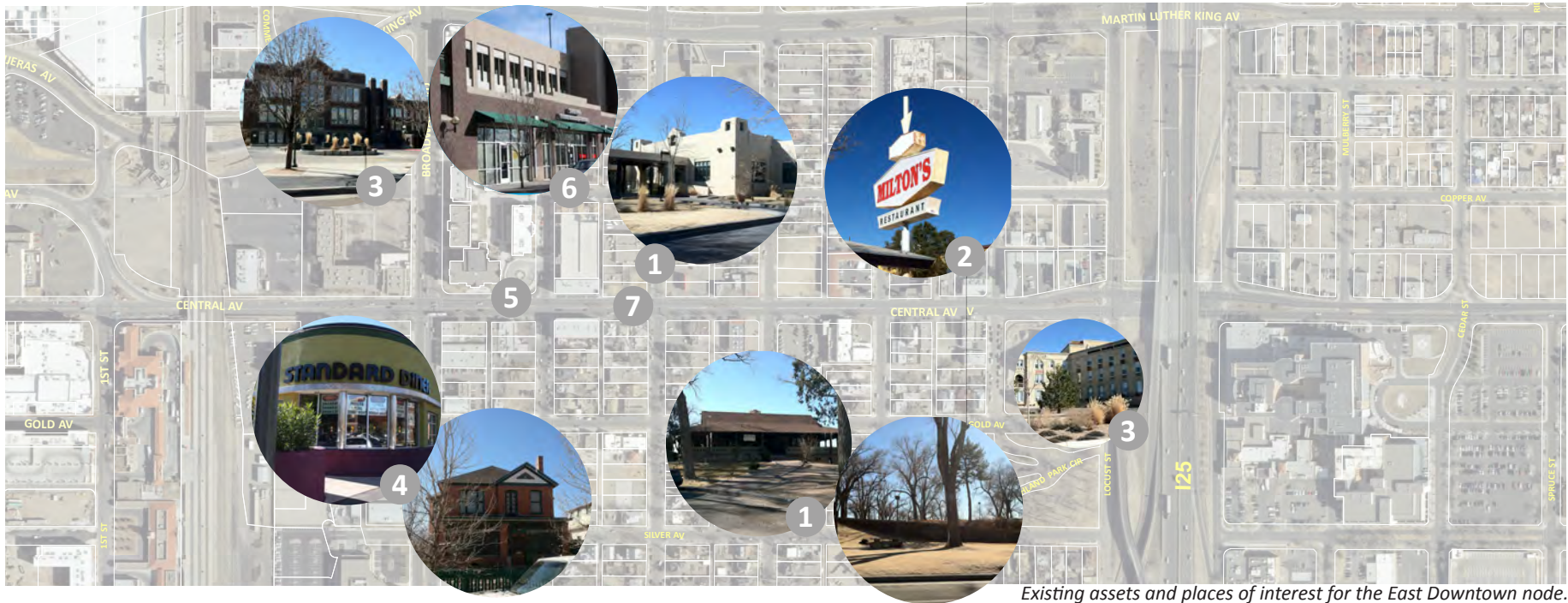
Existing assets and places of interest for the East Downtown node.