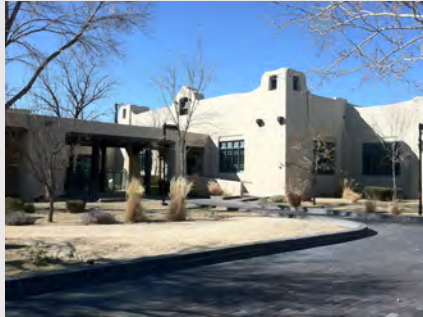
Special Collections Library, (5)