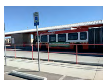
Westside park and ride, (5)