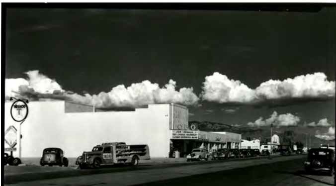
Lobo Theater, Nob Hill, (2)