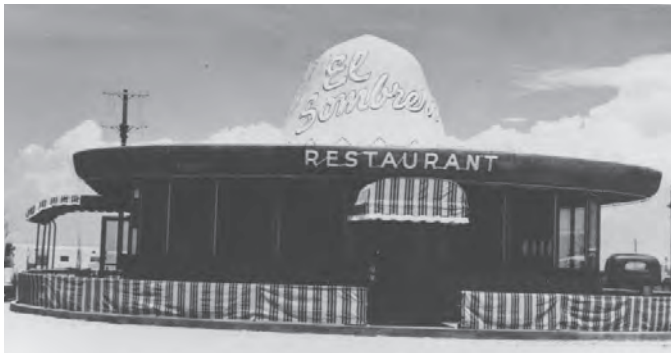
El Sombrero Restaurant, (1)