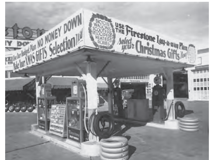
Firestone Tires (1)