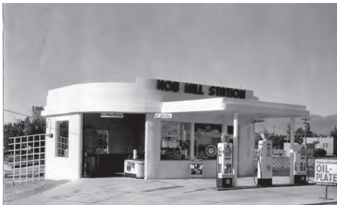
Nob Hill Station, Nob Hill, (2)

The City is committed at this time to “big picture” projects to support the implementation of this Plan and to demonstrate major public investment in the future of Route 66. This section provides funding mechanisms and strategies for implementing Plan projects. It is based on the understanding that City resources are limited and financing strategies need to be creative and flexible with incentives that entice private sector investment.