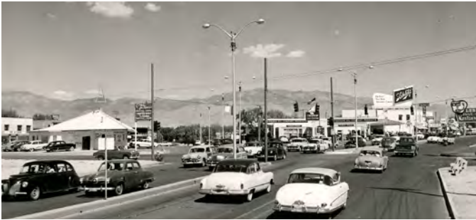
Central Avenue, (2)