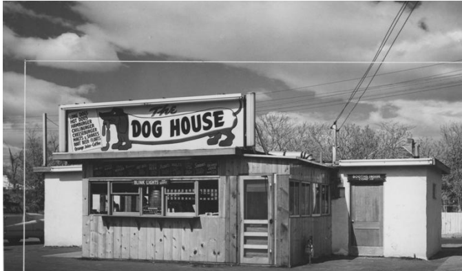
Dog House, (1)