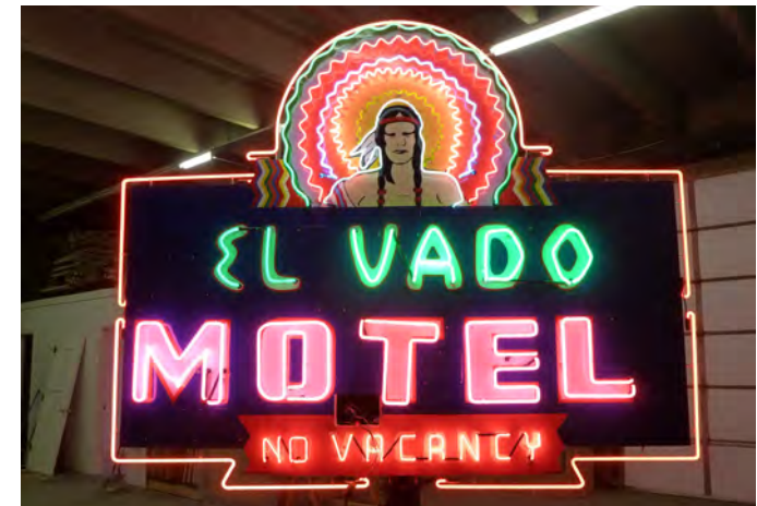
El Vado Sign, restored, (1)