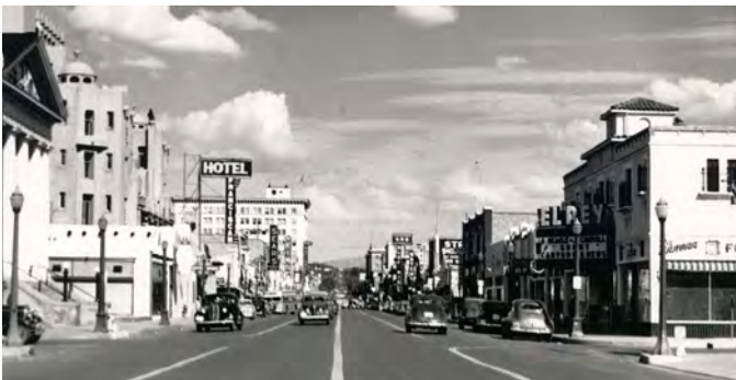
Downtown, looking east, (2)