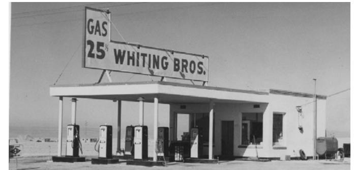
Gas Station, (1)