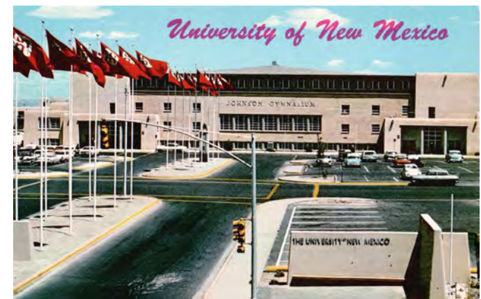
UNM Johnson Gym, postcard, (1)