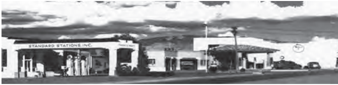
Standard Station, (2)