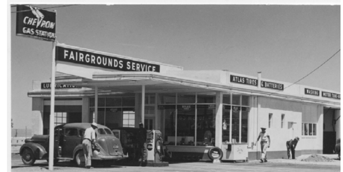
Fairgrounds service station, (1)