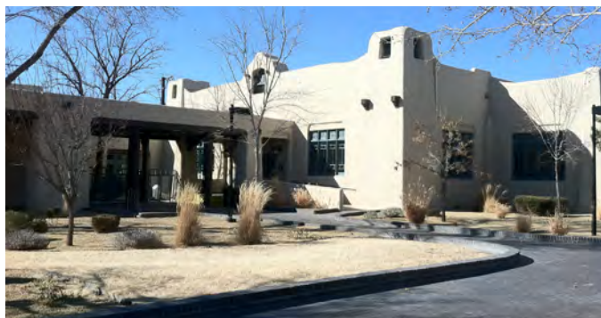
Special Collections Library, (5)