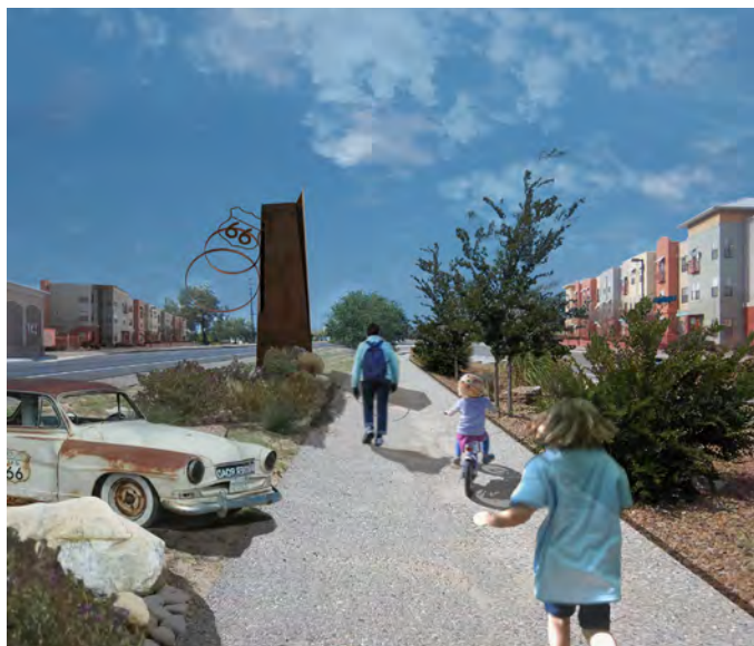
Frontage Road multi-use trail rendering, (5)

Description: Develop an event site with nearby Route 66 accommodations on the western edge of the city. The proximity of the Palisades Park RV campground, the French Quarter Motel, the Adobe Manor and the old café across Central combined with the excess public right of way along the frontage road could provide an opportunity for a public/private partnership to create an attractive event site for national events.