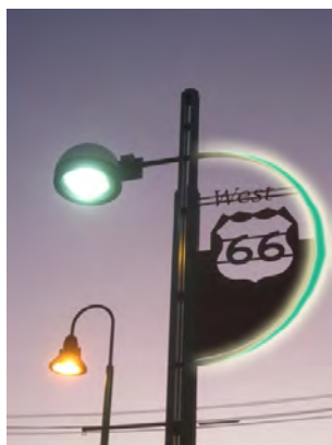
Proposed neon, courtesy of Downtown Action Team

Description: Create an information center or kiosk for tourists and visitors at the historic crossroads. Route 66 branding and neon could be incorporated into the design. Indoor and outdoor exhibit space could feature Route 66/downtown exhibits. A museum shop featuring local museum merchandise could be a combined use.