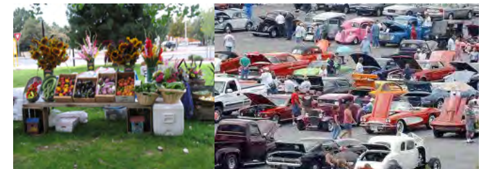
Downtown Grower's Market (5)