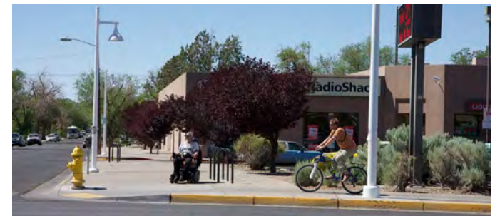
Wide sidewalks, Nob Hill, (5)