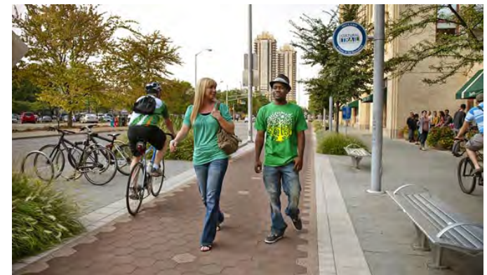
Urban Trail, (6)