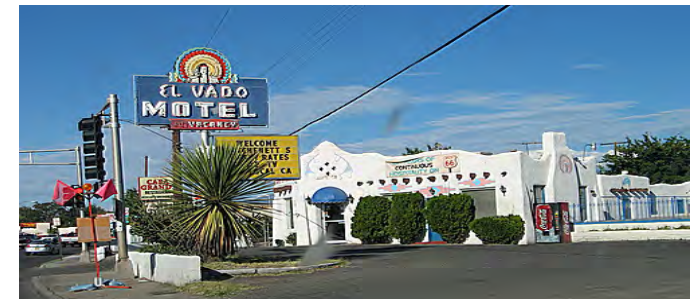
El Vado Motel, (1)