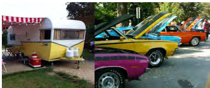
Vintage Shasta Trailer, (6)