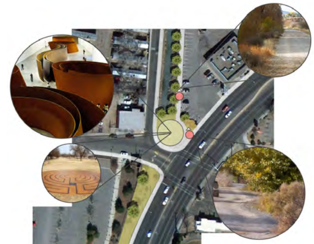
Rendering of pocket park at BioPark, (5)

Description: Develop a public art element at the eastern city limits that coordinates with a public art element at the western city or county limits to create “bookends” for Route 66 in Albuquerque. Empty Chevron signs that can be found on both the east and west end are an opportunity to develop a unique public art piece.