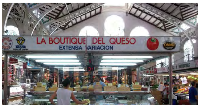
Public market, (6)

Description: Create a linear park featuring neon signs that is experienced by both the pedestrian and from the automobile by utilizing existing sign frames. Focus areas could include the south side of Central Avenue between San Mateo Boulevard and Madeira Avenue and sign clusters between Mesilla and Virginia Avenues. Project could include rehabilitating signs with public art, neon or Route 66 related elements with a landscaped public space where space allows.