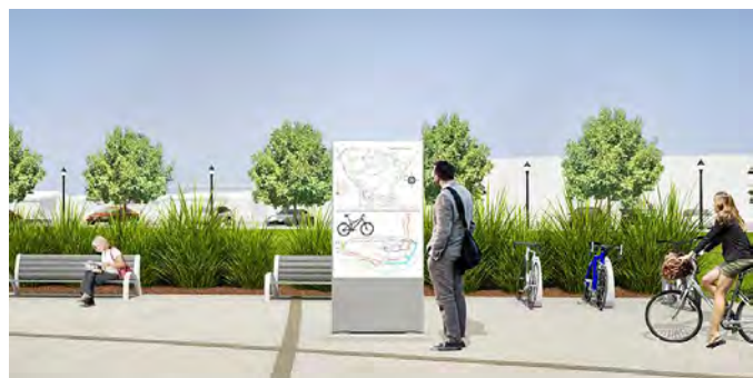
Jefferson, Indiana, wayfinding signage, (6)