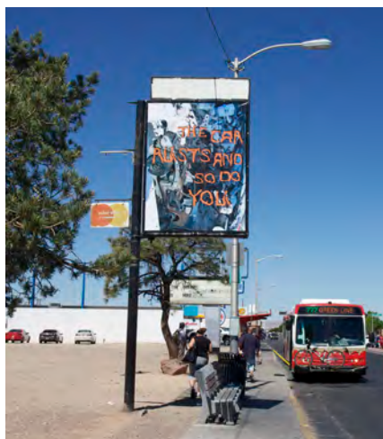
Orphan sign project near San Mateo, (5)