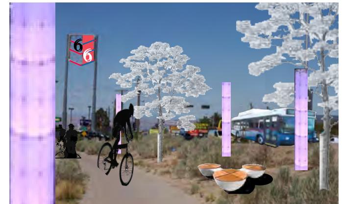
Multi-use trail with public art, (5)