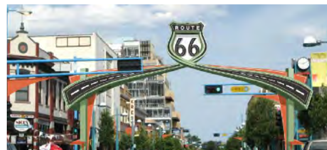
Gateway at crossroads, rendering, EFG Creative

Description: Construct pedestrian improvements and bulb outs at the Broadway and Central intersection and at an intersection near the Parq Central Hotel to facilitate crossing and improve pedestrian safety.